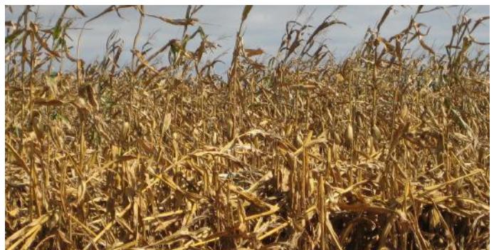
Figure 2. Tar spot is a fungal disease that appears as a series of black spots containing spores on corn leaves (A and B). Depending on the date of infection, the spores may proliferate on the plant's leaves and cause reduced photosynthesis (C), which can lead to stalk cannibalization and poor standability (D).