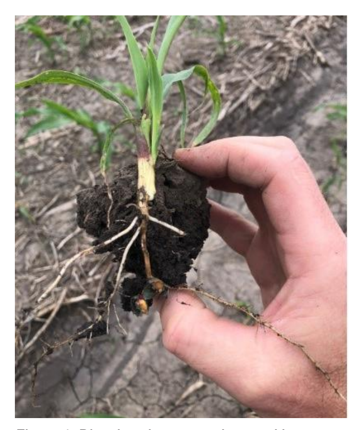
Figure 1. Discolored mesocotyl caused by infection by Pythium.

Fusarium species, like Pythium spp., can cause disease under a wide range of favorable temperatures. But unlike Pythium spp., moisture is not as critical for disease development. Fusarium infections also result in discoloration of the mesocotyl.