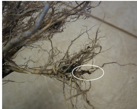
Figure 1B. Root tips had been eaten by CRW.