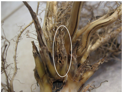
Figure 1D. Heavy root feeding by CRW.