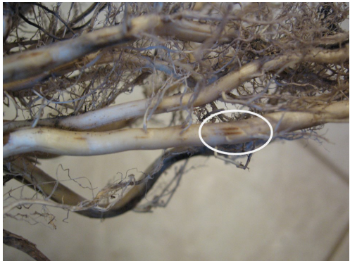
Figure 1A. Extent of damage on root mass.

Figure 1D shows a closer view of heavy feeding from CRW. The appearance of this type of feeding is different from the visual effects of mechanical injury that might occur during the digging process.