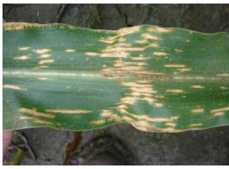
Figure 7. Southern corn leaf blight on a corn leaf.