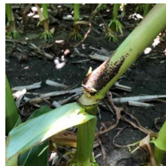
Figure 5. Physoderma brown spot foliar (left) and node breakage (right).

sometimes be visible in the middle of lesions. Heavily infected leaves can wither and die. This disease thrives in warm, humid weather. The same fungal pathogen is responsible for both anthracnose leaf blight, top die back, and stalk rot; however, the presence of leaf blight does not indicate that stalk rot will be a problem later in the season. The stalk rot phase is often more damaging than the leaf blight phase.<sup>2</sup>